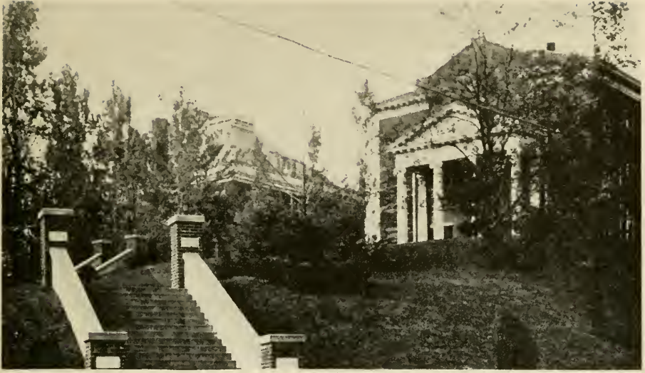
Sue Bennett College, London, Kentucky, center of community and campus activities